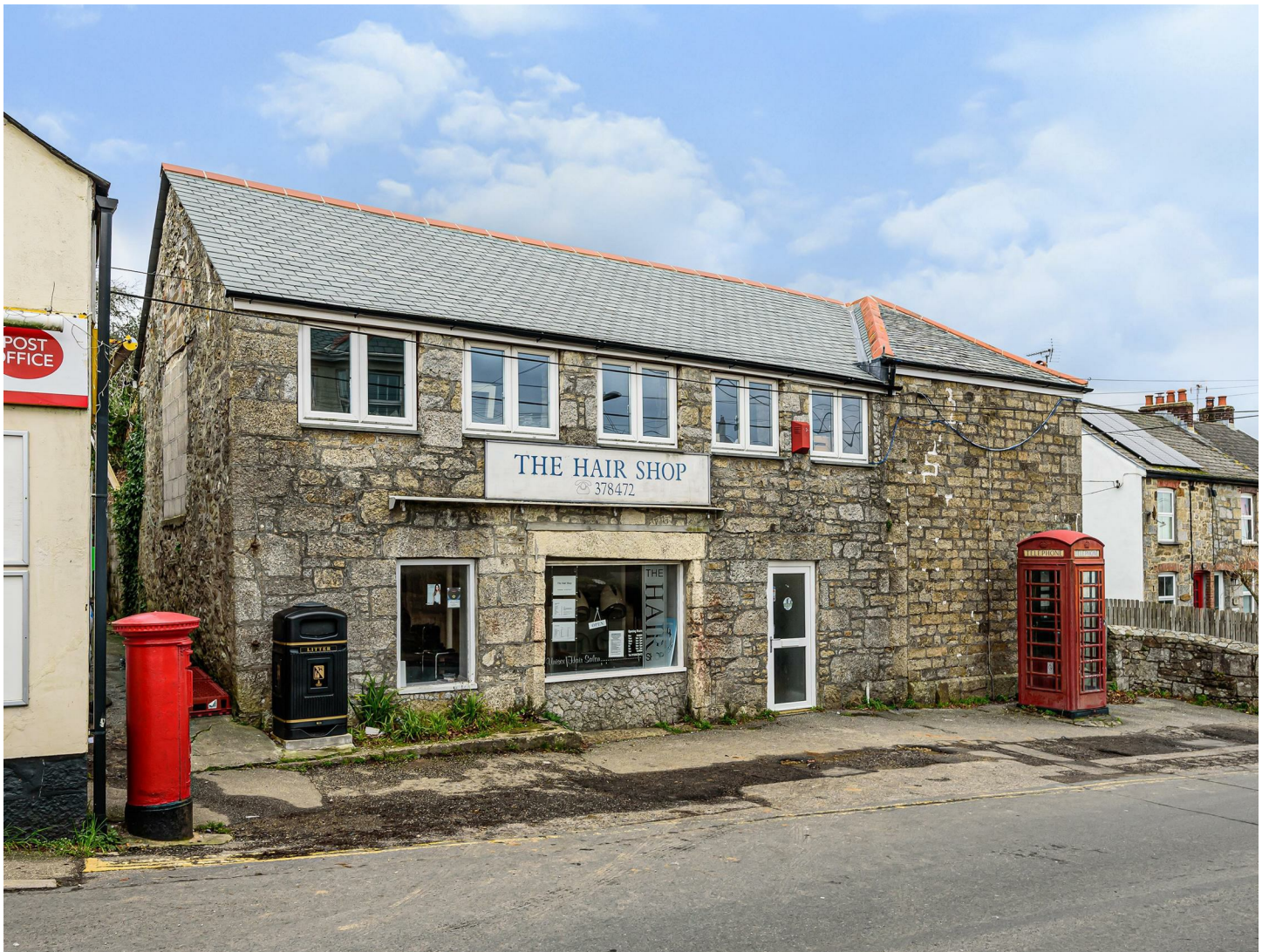
The Hair Shop